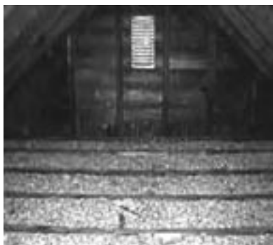
Loose-Fill Vermiculite Attic Insulation

Determining testing and analytical approaches for products containing vermiculite depends on how the material is applied. The vermiculite may be bound into the matrix of another material or the material may exist as loose fill. Since standard analytical methods of sampling and analysis (i.e. core sampling and PLM analysis) were developed for asbestos bound in materials, these methods appear to be appropriate for asbestos associated with vermiculite that was bound into another material.