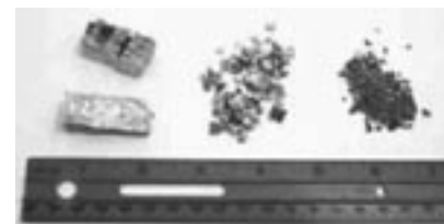
Different Grades of Vermiculite

Determining the asbestos content in vermiculite has become a source of confusion and uncertainty within the asbestos community. Building owners have questions about testing and handling the material, and asbestos professionals are at a loss for hard, fast answers. Currently, Federal and State government agencies do not have any official response to many of these questions. USEPA has some research methods that they are reviewing, but none of them have been officially approved. Without approved testing protocols, the only safe response is to assume the material is asbestos and treat it accordingly. This response is one building owners do not want to hear. This leaves asbestos professionals with a series of gray responses to evaluate.