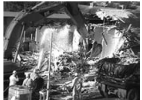
AACM demolition in progress

The Fort Chaffee project selected two buildings that were isolated from population centers and similar enough to give comparable data results. The first building was demolished using the existing (NESHAP) method, which requires the removal and disposal of the asbestos before demolition. A trained and certified crew of nine workers first hand-cleaned and sorted the asbestos,